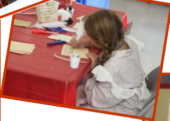
Left: Visitors enjoying the music, break out in dance. Above: Writing with quills is not as easy as it looks!