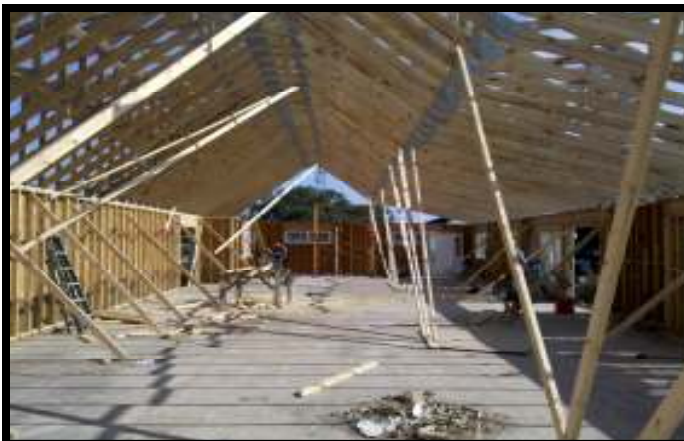
Future home of the NC Maritime Museum