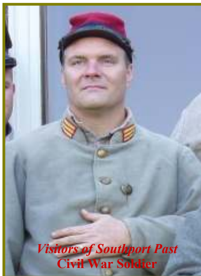
Visitors of Southport Past Civil War Soldier