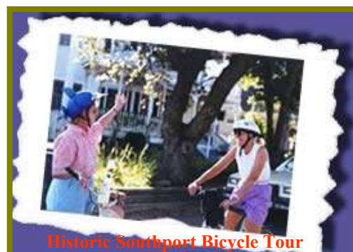
Historic Southport Bicycle Tour

time Museum at Southport will team up with the Adventure Company to offer two bicycle tours of Historic Downtown Southport. Museum docent and Adventure Company tour leader will take participants through the live oak-canopied streets and along the waterfront, explaining its history as you pedal by Fort Johnston, Brunswick Inn, the Old Brunswick Jail, the Crimes of the Heart Home, The Indian Trail Tree, along the Cape Fear River and more. Bikes are single-speed, pace is slow, and all participants must wear helmets. Meet at the Adventure Company on Howe St. Fee is $20 for bike/helmet rental and tour (bring your own bike, $15.) Space is limited. Two day advanced registration and pre-payment is required. Call the Adventure Company: (910)454-0607. For more detailed information, call the NC Maritime Museum at Southport: (910)457-0003.