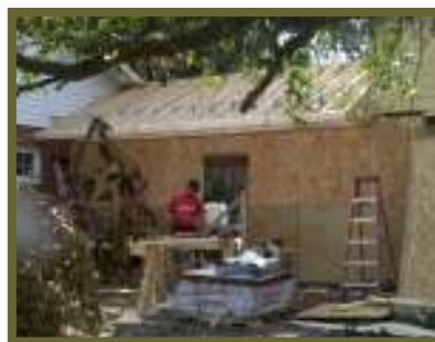
Cornerstone Builders, Inc. connect the buildings at the corner of Moore and Davis Streets

The bluff known as Fort Johnston has endured centuries of challenge and change; this year is no exception. Two one-story brick duplex apartment buildings were erected there in 1957 to house families of Military Ocean Terminal Sunny Point (MOTSU) officers. The Commanding Officer lived with his family in the nearby Garrison House, originally built in 1810 for use as Officer's Barracks. It was extensively renovated in 1959, and is the only structure remaining from the centuries of military occupation. The scenery changed yet again as the two apartment buildings today became one, physically connected and designed to house the North Carolina Maritime Museum at Southport. The Museum is moving from its 18-year home on Howe Street to the