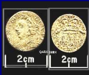
Since the start of the Queen Anne's Revenge shipwreck project in 1996, tens of thousands of artifacts have been recovered. Pictured is a coin weight with the likeness of Queen Anne.