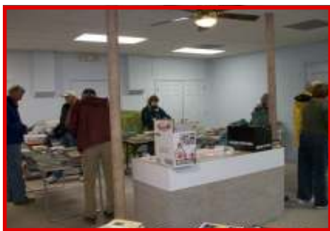
Visitors peruse the books in the old library