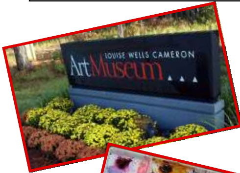
Cameron Art Museum