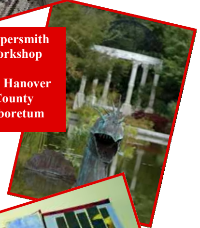
New Hanover County Arboretum