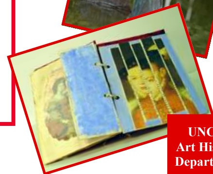
UNCW Art History Department