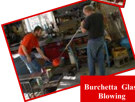
Burchetta Glass Blowing