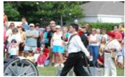
Randy giving up town