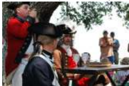
Trial of Bonnet

The twinkling lights in the Davis Street oak trees shielding the encampment lent a magical atmosphere of quiet evening conversation and visitation of local families on evening walks along the waterfront. The Maritime Museum's surprise adventure was the beginning of the "Pirate Invasion" you know today. (Mary Strickland)