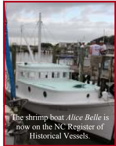
The shrimp boat Alice Belle is now on the NC Register of Historical Vessels.

Program will be held at the Southport Community Building, 223 E. Bay Street. Admission is free. Call (910)457-0003 for details and to register.